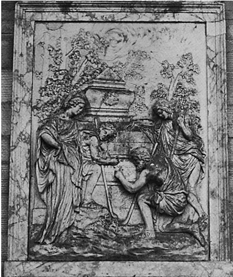
'Shepherds in Arcadia' – Relief: Shugborough Hall

Far more could be said about the British landscape Zodiac, but this is sufficient for the purpose of this essay. A further description of the British Zodiac that includes how it was discovered as well as notes about the Masonic Compass, the Gypsy Switches, the AA Points, the Boar of Britain and The Most Holy Way of Brân, can be found in "The British Zodiac" study paper.