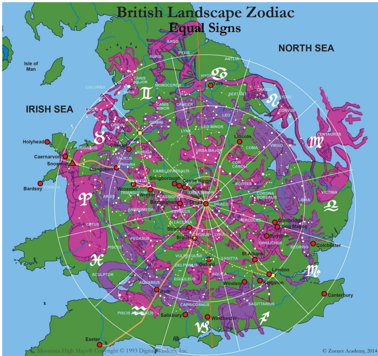
Diagram 1: The Landscape Zodiac of Britain (Equal Signs)

The British Landscape Zodiac is an archetypal energy pattern that underlies the landscape of Britain—a pattern that appears to have been originally laid out by the Celtic people (the Britons or Brythonic race) and which the Romans and subsequent rulers and wisdom-holders seem to have recognised and used, right up to the time of the Tudors and even into the 18th century.