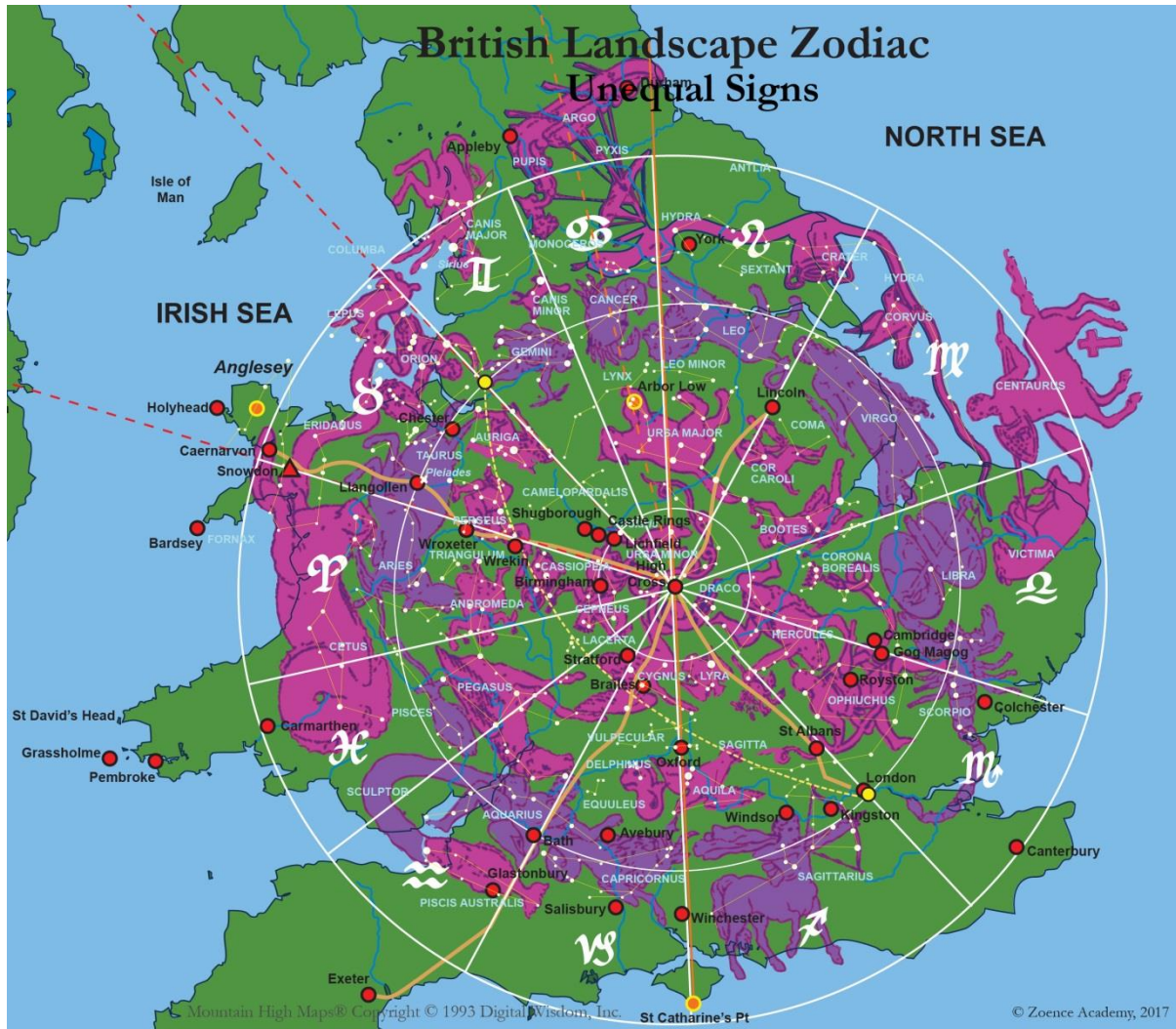
Diagram 2: The Landscape Zodiac of Britain (Unequal Signs)

The division into twelve unequal signs was also used, with the width of each sign or section matching the width of its zodiacal constellation. (See diag. 2.)