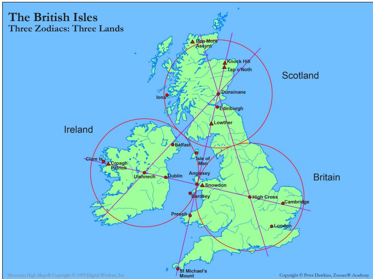
Diagram 4: The Three Lands/Zodiacs of the British Isles

mountain in the west, thereby forming a primary east-west axis of the landscape zodiac of Ireland. In the other direction this particular axis tracks east of High Cross to form the cusp of Scorpio-Libra in the British Zodiac, passing through the Gog Magog hills near Cambridge. These hills, dotted with hill forts, are named after the giant, Gog, of the race, Magog, who according to legend ruled Britain (then known as Albion) before Brutus and the British race took over.