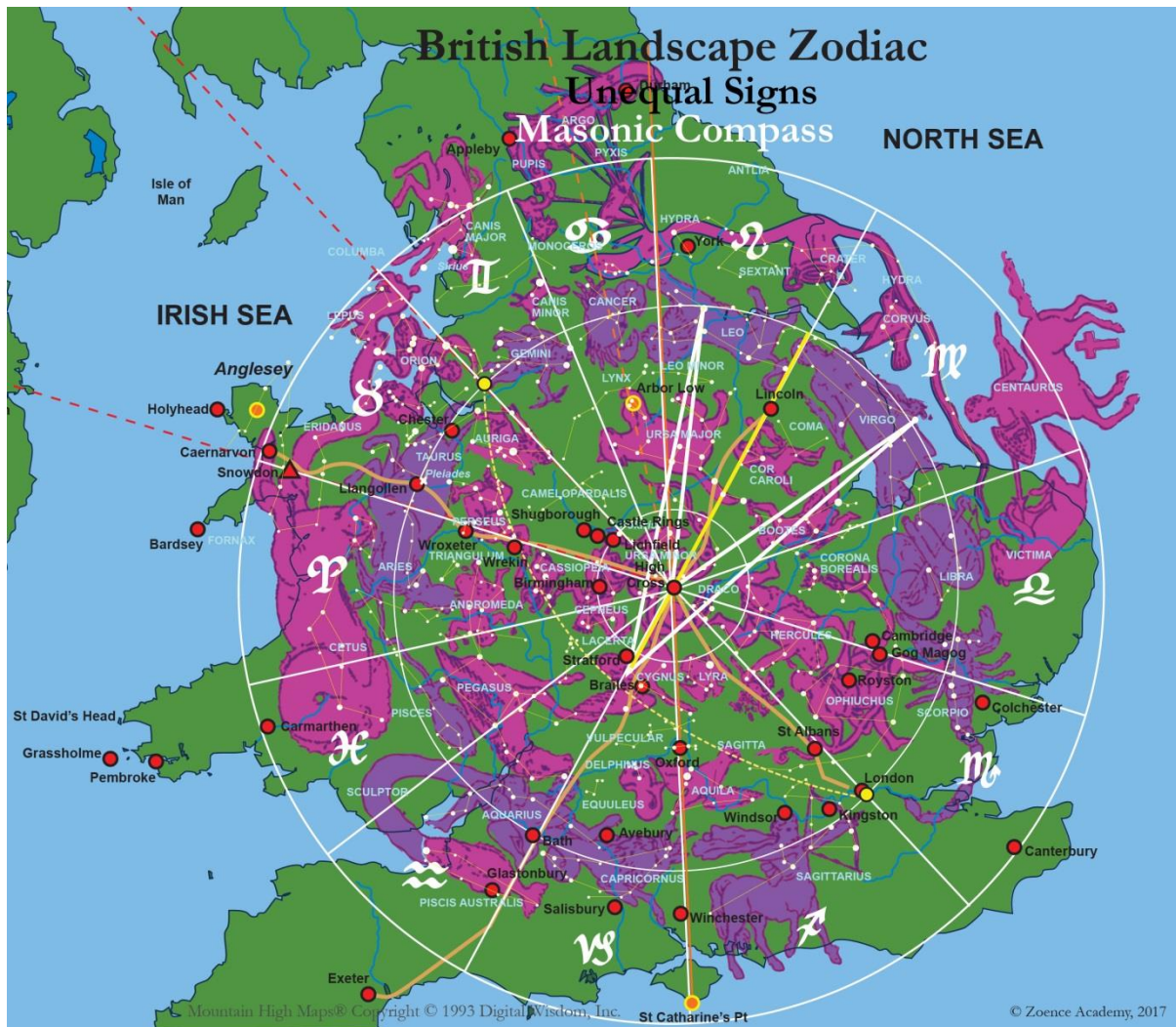
Diagram 5: The Landscape Zodiac of Britain (Unequal Signs) – Masonic Compass

In the Dionysian myth, when Dionysus is born he has the symbolic form of a bull calf known as Zagreus. He is then attacked by the Titans who chase him. Zagreus manages to escape them by changing his form many times, but when he eventually reverts back to being a young bull, the Titans catch him and start to tear him to pieces. However, his heart is rescued by Pallas Athena, who raises it up (i.e. ascends it), building around it (or turning it into) a body of light. Pallas Athena is known as the Spear-shaker or Shakespeare. She is the Tenth Muse, the Muse of muses, who knows all wisdom and inspires all others. Like Sarasvati, she is the great goddess of language, poetry, art and science.