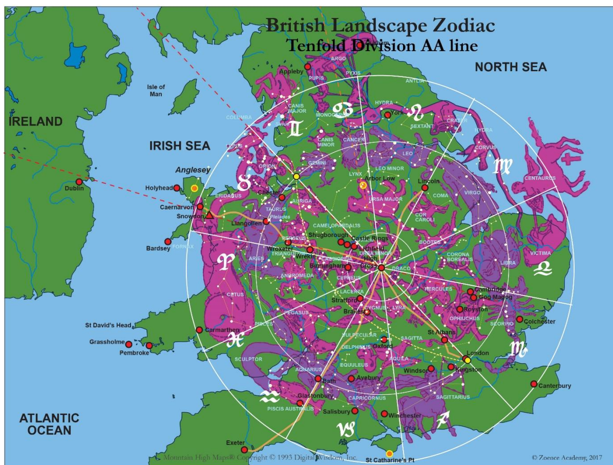
Diagram 3: The Landscape Zodiac of Britain (Ten-fold Division)

The Zodiac, subdivided into twelve or ten divisions, was a pattern habitually used by the Celtic people and other races, by means of which they laid out and ‘mapped’ their local and national landscapes in a recognisable way, and at the same time ‘married’ the wisdom of the sky (heavens) with the land (earth). In this way both history and myth were joined together in a way that expressed the wisdom, and people could relate to each other and find each other according to where they lived within the organised and mythologised landscape.