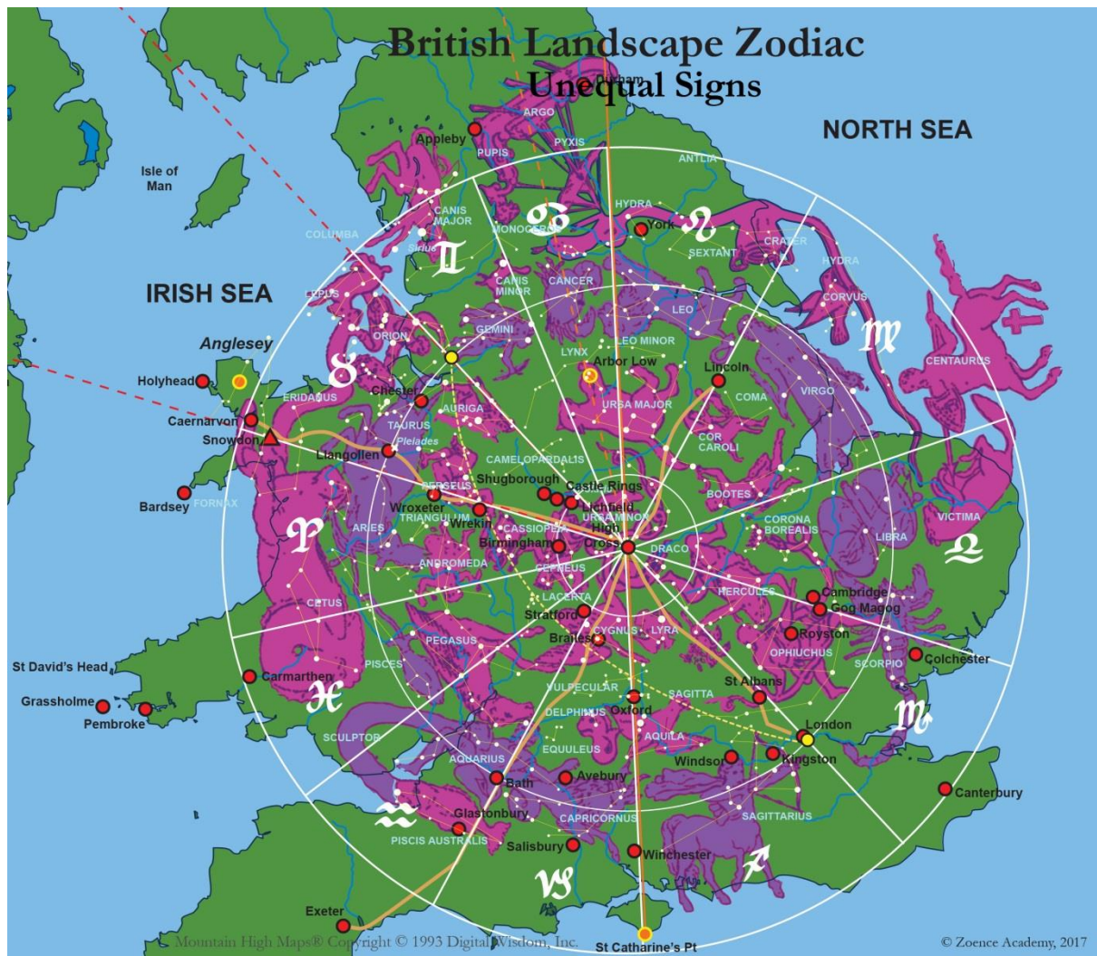
Diagram 2: The Landscape Zodiac of Britain (Unequal Signs)

The division into twelve unequal signs was also used, with the width of each sign or section matching the width of its zodiacal constellation. (See diag. 2.)