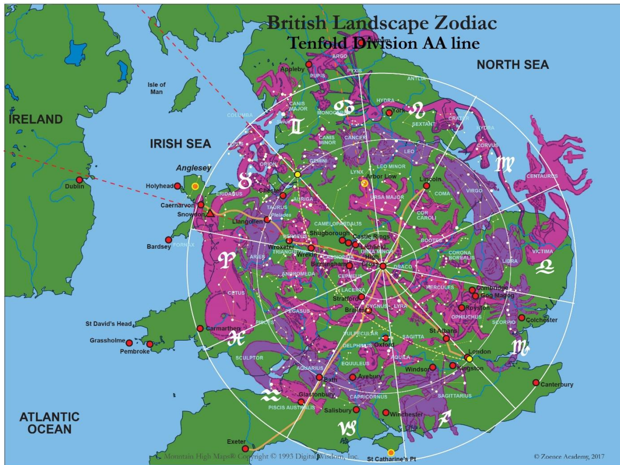
Diagram 3: The Landscape Zodiac of Britain (Ten-fold Division)

The Zodiac, subdivided into twelve or ten divisions, was a pattern habitually used by the Celtic people and other races, by means of which they laid out and 'mapped' their local and national landscapes in a recognisable way, and at the same time 'married' the wisdom of the sky (heavens) with the land (earth). In this way both history and myth were joined together in a way that expressed the wisdom, and people could relate to each other and find each other according to where they lived within the organised and mythologised landscape.