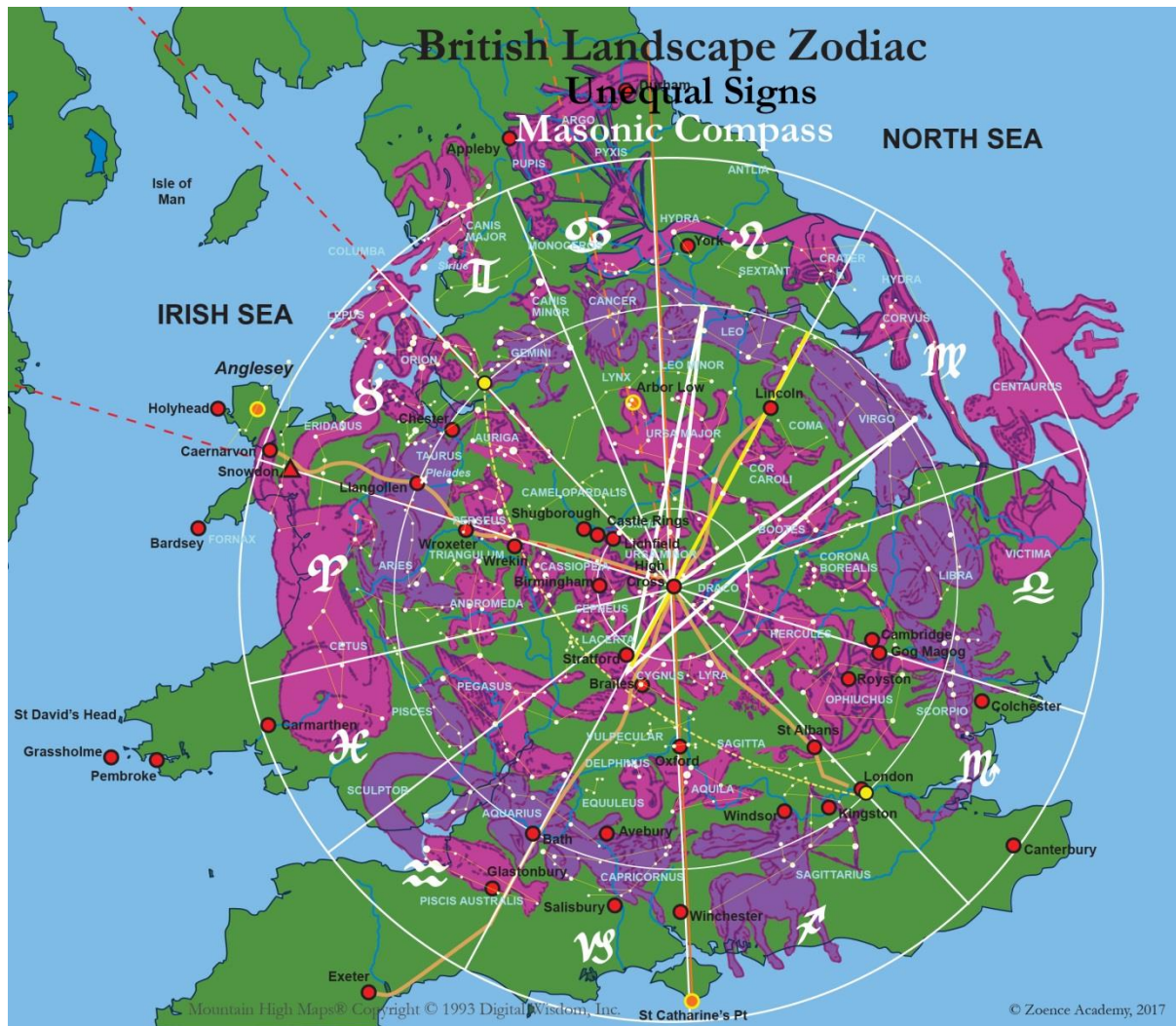
Diagram 5: The Landscape Zodiac of Britain (Unequal Signs) – Masonic Compass

In the Dionysian myth, when he is first born he is known as Zagreus and he is attacked by the Titans who start to tear him to pieces. His heart is rescued by Pallas Athena, who raises it up (i.e. ascends it), building around it a body of light. Pallas Athena is known as the Spear-shaker or Shakespeare. She is the Tenth Muse, the Muse of muses, who holds all wisdom and inspires all others. Like Sarasvati, she is the great goddess of language, poetry, art and science.