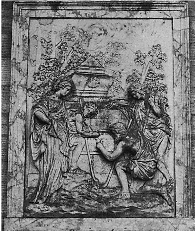
'Shepherds in Arcadia' – Relief: Shugborough Hall

Far more could be said about the British landscape Zodiac, but this is sufficient for the purpose of this essay. A further description of the British Zodiac that includes how it was discovered as well as notes about the Masonic Compass, the Gypsy Switches, the AA Points, the Boar of Britain and The Most Holy Way of Brân, can be found in "The British Zodiac" study paper.