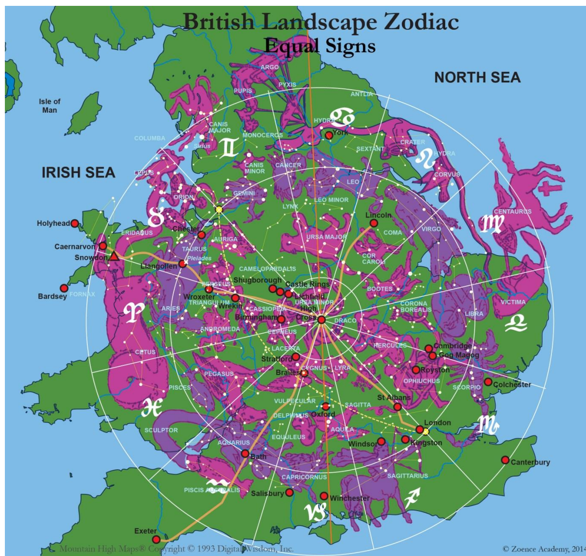
Diagram 1: The Landscape Zodiac of Britain (Equal Signs)

The British Landscape Zodiac is an archetypal energy pattern that underlies the landscape of Britain—a pattern that appears to have been originally laid out by the Celtic people (the Britons or Brythonic race) and which the Romans and subsequent rulers and wisdom-holders seem to have recognised and used, right up to the time of the Tudors and even into the 18th century.