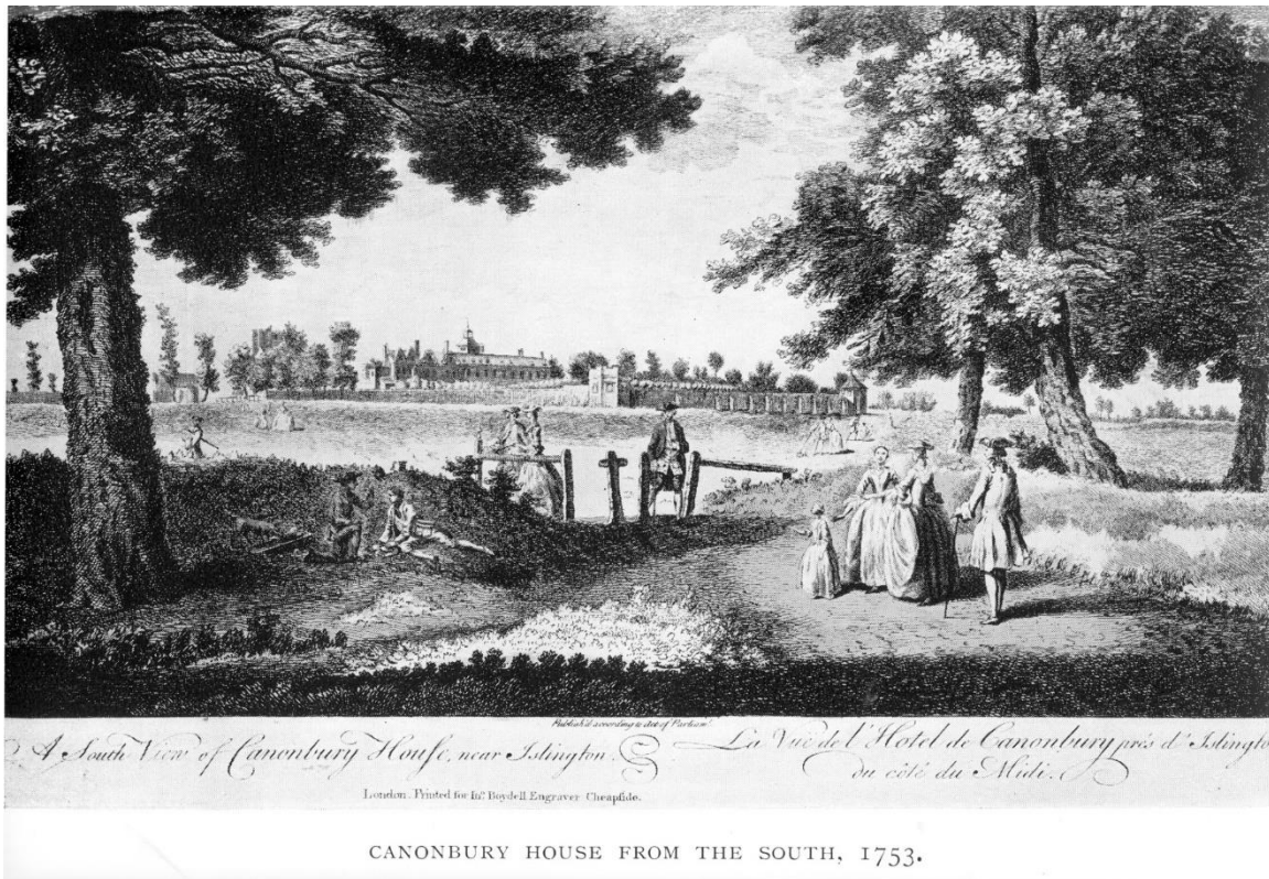
CANONBURY HOUSE FROM THE SOUTH, 1753.

Sir John Spencer largely rebuilt and refurbished the early Tudor building, in particular extending the east range, adding gable windows and constructing elaborate moulded plaster ceilings over the long gallery and adjacent rooms. 6 The outward appearance of Canonbury Place at his death can only be guessed at by prints of over a century later.